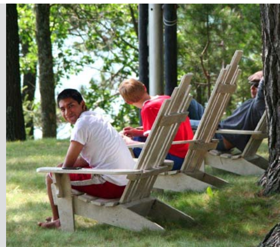
STUDENTS RELAXED AT THE LOYOLA VILLA.

In addition to the Jesuits on staff at Loyola Villa, several Jesuits came from the Midwest to help host the event.